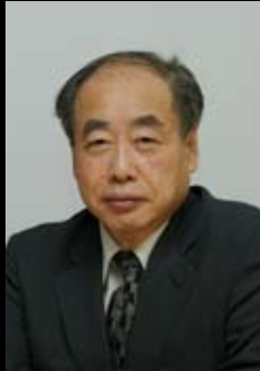
Makoto Kobayashi Research Center for Science Systems, JSPS “On the World of Elementary Particles”

“Superconductivity in Strongly Correlated Electron Systems”